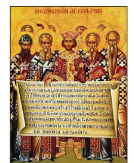
Icon depicting Constantine the Great, accompanied by the bishops of the First Council of Nicaea (325)

This study will start Wed, Jan 29 at (325) both 10 am & 7 pm , and run for four weeks. Look for sign-up sheets in the foyer.