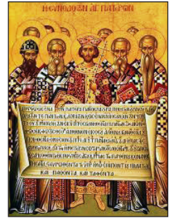
Icon depicting Constantine the Great, accompanied by the bishops of the First Council of Nicaea (325)

This study will start Wed, Jan 29 at both 10 am & 7 pm , and run for four weeks. Look for sign-up sheets in the foyer.