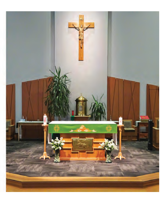
Our Faith Family