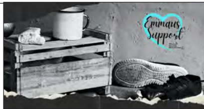
For people who live on the streets without access to adequate healthcare, mental health support or safe, secure shelter, Lord, hear our prayer.

Since 1949, May has often been set aside by various Western nations as a month dedicated to raising awareness around mental health needs and the reduction of mental health-related stigma.